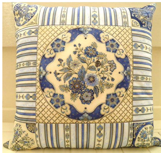
Cushion 17" x 17"

Show off your Dutch inspired fabrics in this easy to piece runner and then complete the picture with a Dutch plate cushion, using your left over fabrics!