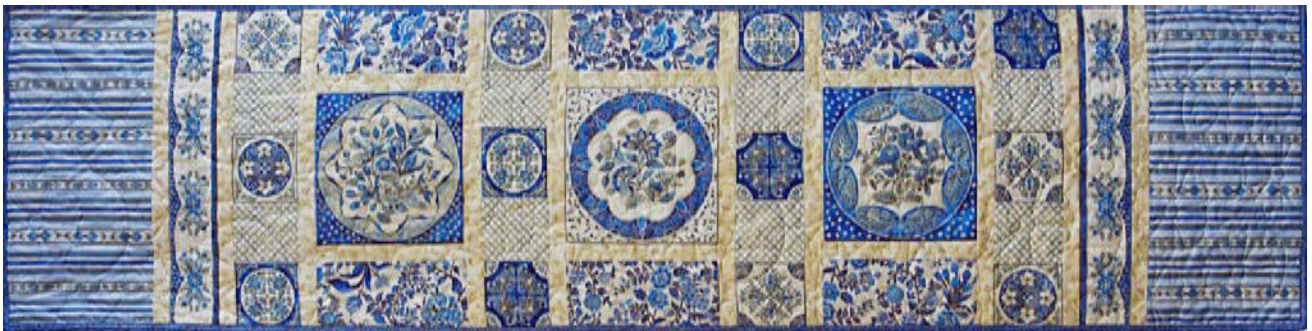
Runner 67" x 19"