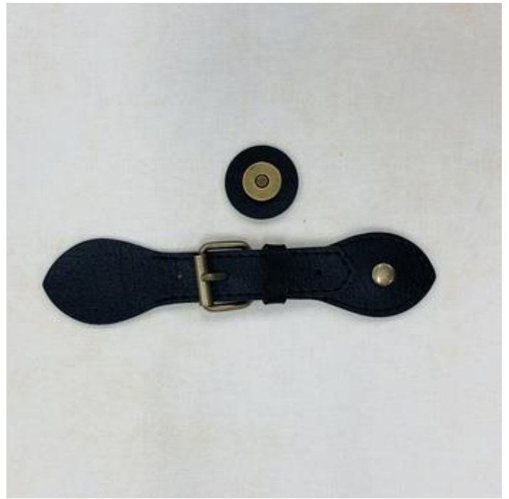
Magnetic Buckle Snaps $10 each