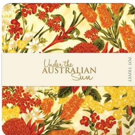
UTAS Trivet - Cream Orange