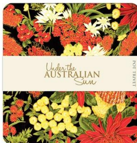
UTAS Trivet - Red Black

So, have a great week everyone, and I look forward to seeing some of you later this week at our Open Days. If you have any questions, just give us a call, on 03 9587 3958.