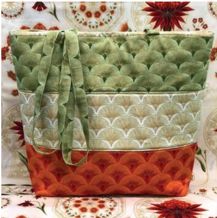
Summertime Tote - Australis kit - $29.50 deluxe kit - $42.50

I've made up our Summertime Tote Free Download pattern in the new Melba Fan prints, and they look pretty nice, might just have to snatch one for myself.