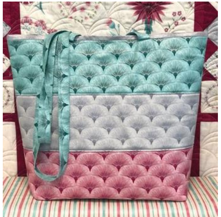
Summertime Tote - Nouveau kit - $29.50 deluxe kit - $42.50