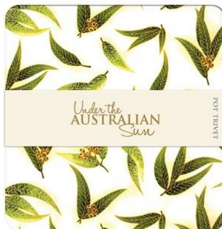
UTAS Trivet - Gum Leaves